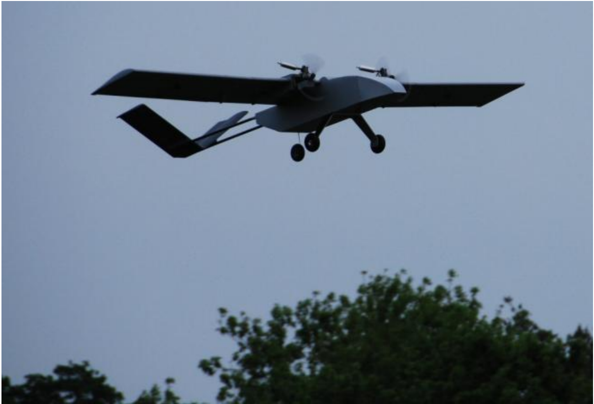
Above: the "VEE" tail InView IV-03 variant, test flown on 25 th May 2010. Although the tail weight was further reduced, the flight characteristics were sluggish and this configuration was dropped. First flight on 25 May 2010.