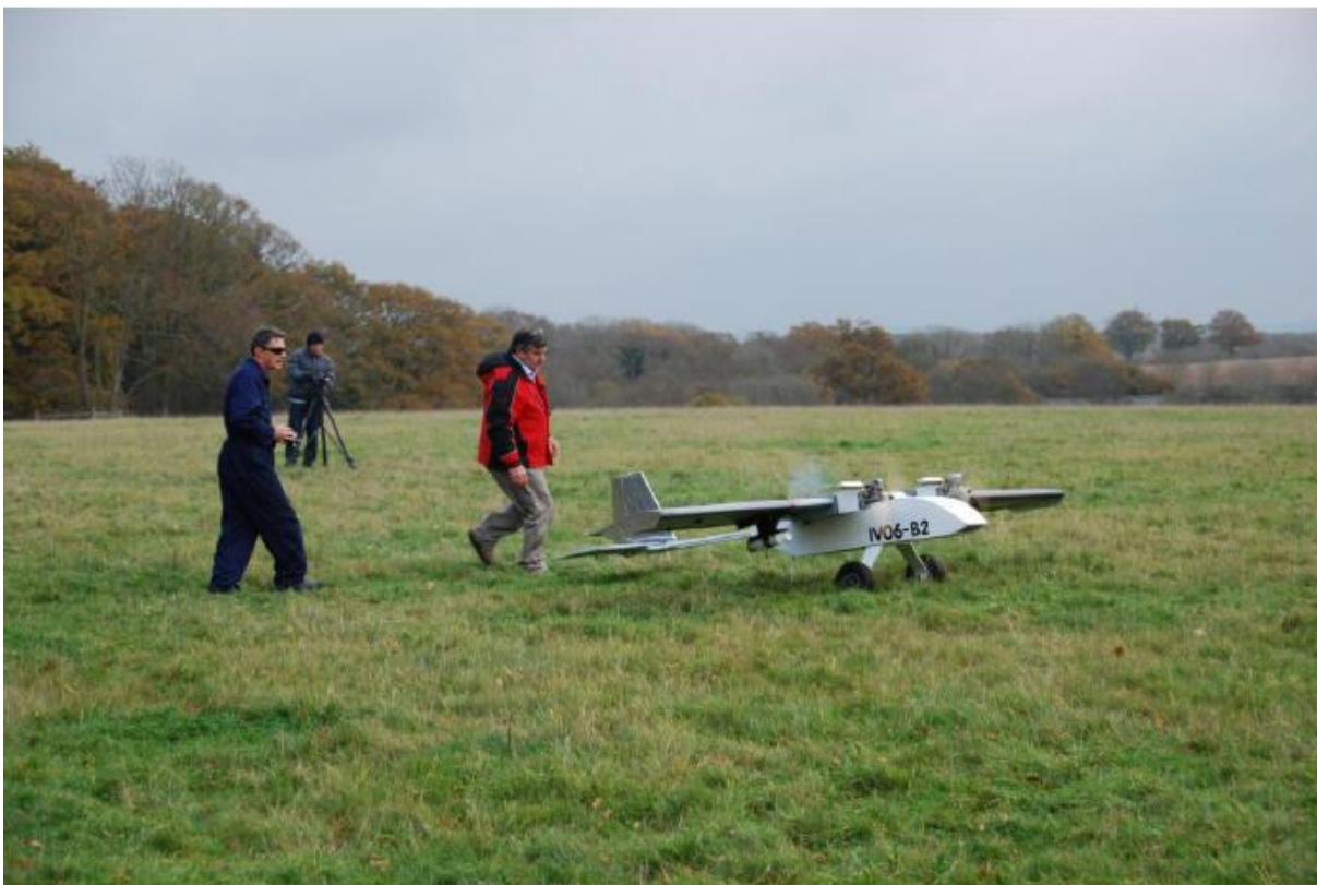
In IV-06 we added an attachment point at the edge of each wing tip, and modified the undercarriage to have 2 large wheels at the front, and 2 smaller wheels at the back. First Flight on 22 November 2010.