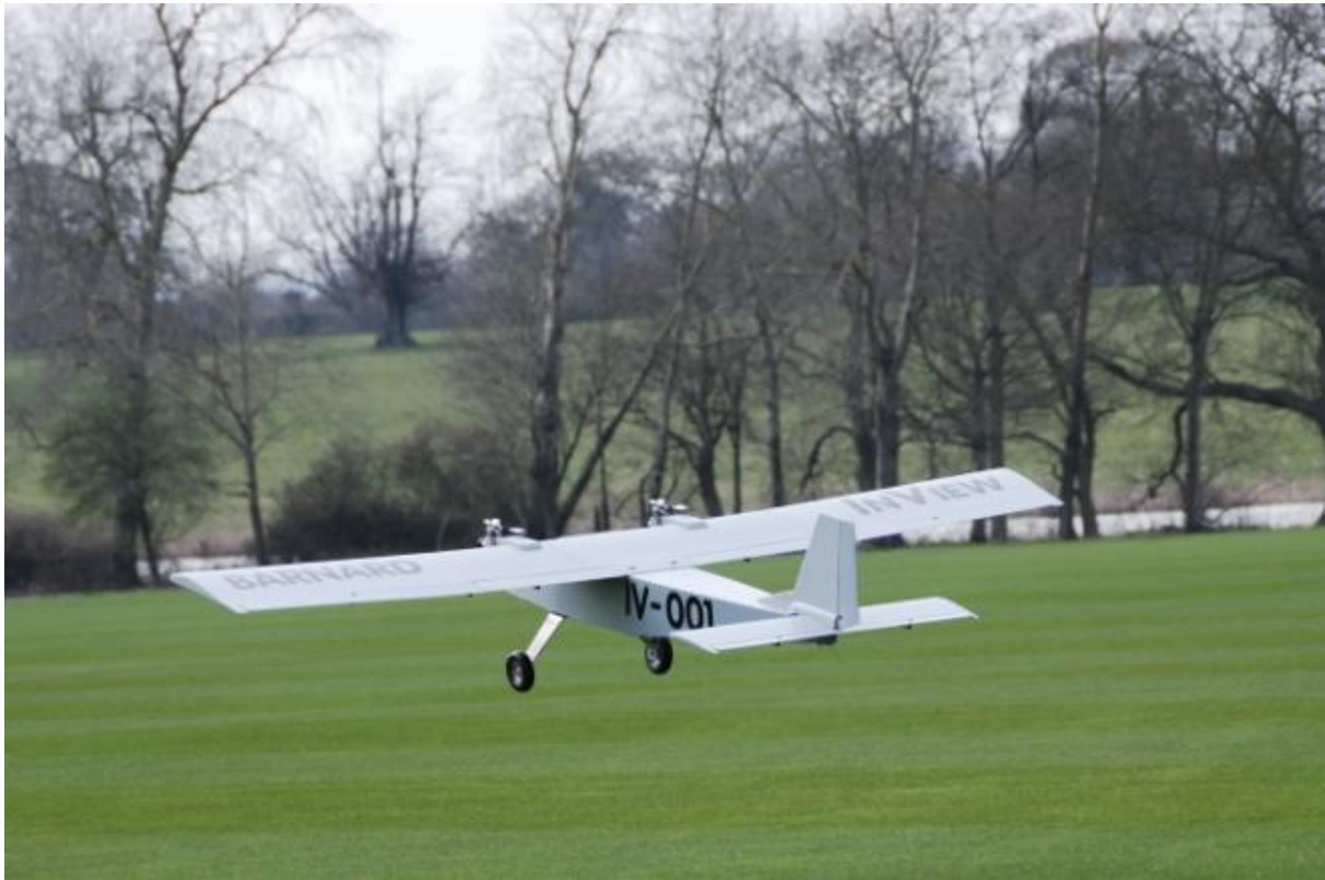
Above: The InView IV-001 was based on the Telemaster Senior design. The Telemaser Senior, however, had a single engine at the front, but we needed a twin engine configuration. Due to the relocation of the engines, this design was too tail heavy. First Test Flight on 9 April 2010.