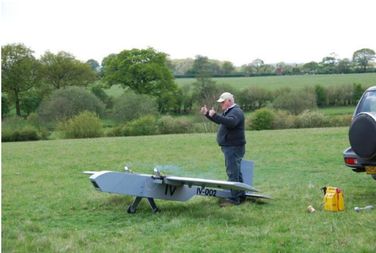
The IV-002 had a reduced weight tail section, but was still tail heavy. First flight on 29 April 2010