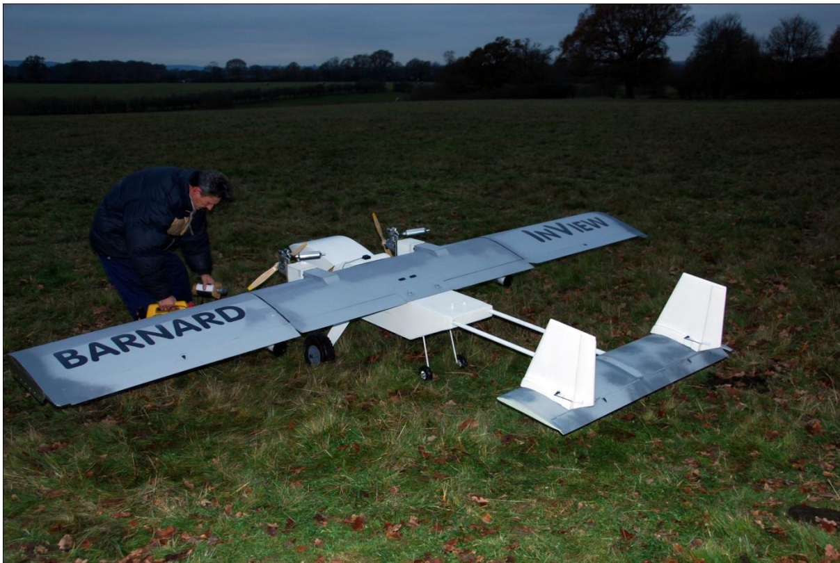
The InView twin tail fin IV-06 variant being prepared for a test flight on a late Winter afternoon.

Since it appeared to us that no existing unmanned aircraft satisfied the requirements we defined, we considered this to represent a market opportunity, and developed, flight tested and evolved the InView unmanned aircraft as a technology demonstrator and test bed. The main attributes are as follows: