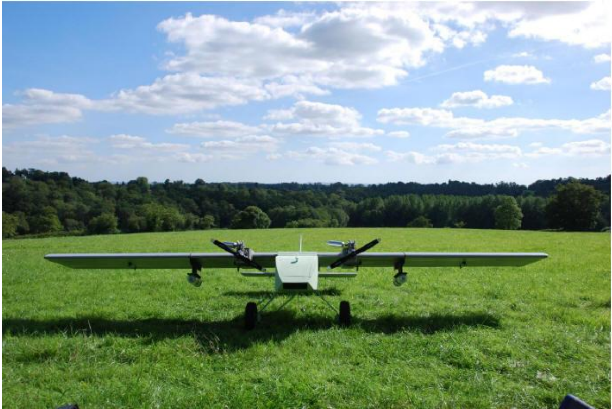
We added a forward viewing window, side windows and a rear window to IV-05, shown above. The first Test Flight on 20 July 2010.