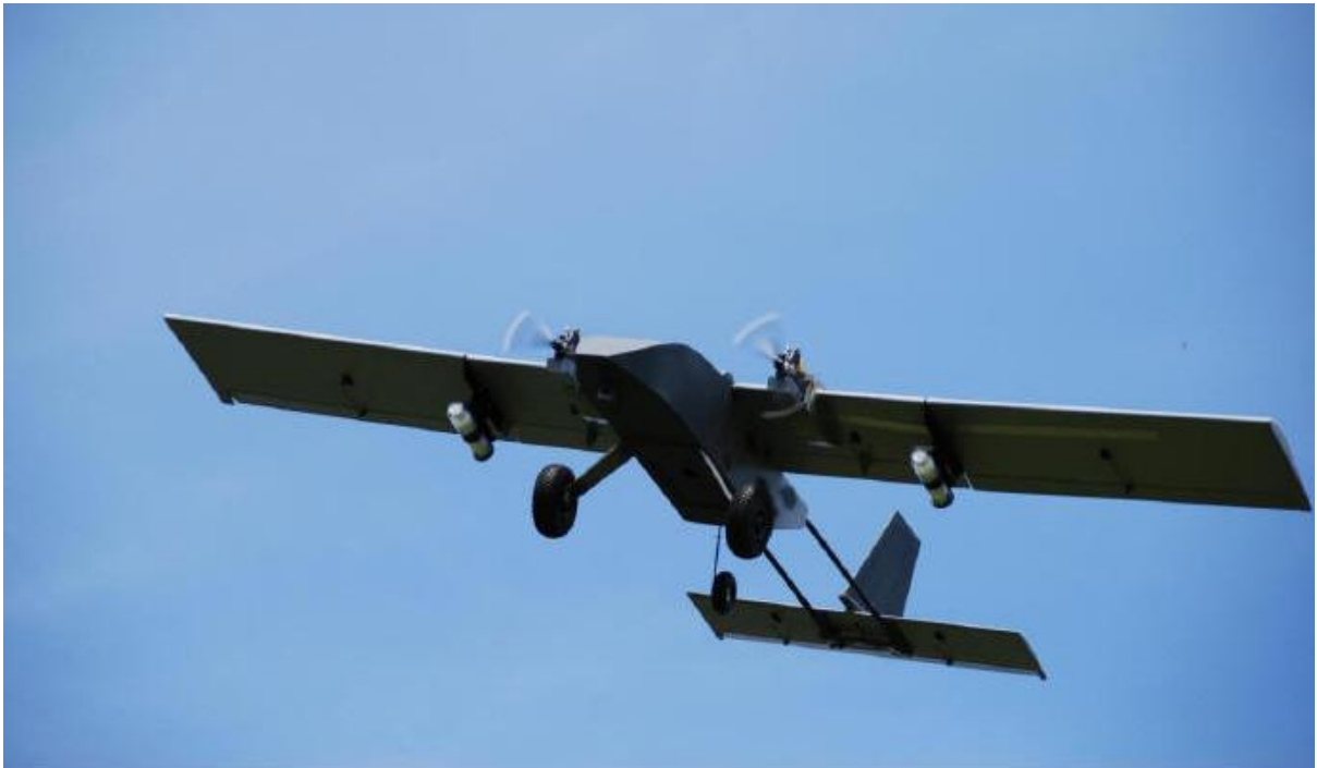
Above: IV-04, with under-wing mounting points for scientific instruments, such as magnetometers. This variant flew well, and set the baseline for further enhancements. First flight on 4 June 2010.